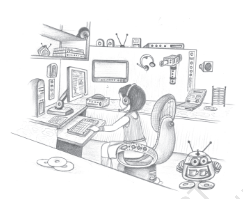
The mechanical teacher was flashing on the screen...

because her mother said little girls learned better if they learned at regular hours.