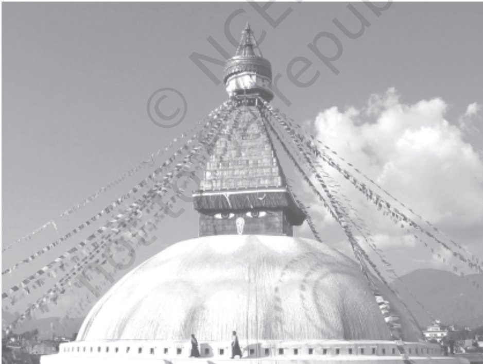
The Baudhnath Stupa, Kathmandu

4. Kathmandu is vivid, mercenary, religious, with small shrines to flower-adorned deities along the narrowest and busiest streets; with fruit sellers, flute sellers, hawkers of postcards; shops selling Western cosmetics, film rolls and chocolate; or copper utensils and Nepalese antiques. Film songs blare out from the radios, car horns sound, bicycle bells ring, stray cows low questioningly at motorcycles, vendors shout out their wares. I indulge