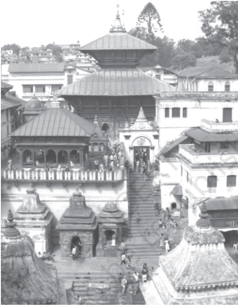
Pashupatinath Temple, Kathmandu

that flows below. A corpse is being cremated on its banks; washerwomen are at their work and children bathe. From a balcony a basket of flowers and leaves, old offerings now wilted, is dropped into the river. A small shrine half protrudes from the stone platform on the river bank. When it emerges fully, the goddess inside will escape, and the evil period of the Kaliyug will end on earth.