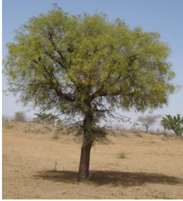
Figure 16.3 Khejri Tree

environmentally and developmentally sound – in other words, while the environment is preserved, the benefits of the controlled exploitation go to the local people, a process in which decentralised economic growth and ecological conservation go hand in hand. The kind of economic and social development we want will ultimately determine whether the environment will be conserved or further destroyed. The environment must not be regarded as a pristine collection of plants and animals. It is a vast and complex entity that offers a range of natural resources for our use. We need to use these resources with due caution for our economic and social growth, and to meet our material aspirations.