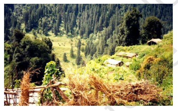
Figure 16.2 A view of a forest life

Do you think such use of forest resources would lead to the exhaustion of these resources? Do not forget that before the British came and took over most of our forest areas, people had been living in these forests for centuries. They had developed practices to ensure that the resources were used in a sustainable manner. After the British took control of the forests (which they exploited ruthlessly for their own purposes), these people were forced to depend on much smaller areas and forest resources started becoming over-exploited to some extent. The Forest Department in independent India took over from the British but local knowledge and local needs continued to be ignored in the management practices. Thus vast tracts of forests have been converted to monocultures of pine, teak or eucalyptus. In order to plant these trees, huge areas are first cleared of all vegetation. This destroys a large amount of biodiversity in the area. Not only this, the varied needs of the local people – leaves for fodder, herbs for medicines, fruits and nuts for food - can no longer be met from such forests. Such plantations are useful for the industries to access specific products and are an important source of revenue for the Forest Department.