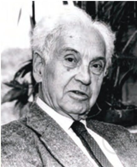
Ernst Mayr (1904 – 2004)

Born on 5 July 1904, in Kempten, Germany, ERNST MAYR, the Harvard University evolutionary biologist who has been called 'The Darwin of the 20 th century', was one of the 100 greatest scientists of all time. Mayr joined Harvard's Faculty of Arts and Sciences in 1953 and retired in 1975, assuming the title Alexander Agassiz Professor of Zoology Emeritus . Throughout his nearly 80-year career, his research spanned ornithology, taxonomy, zoogeography, evolution, systematics, and the history and philosophy of biology. He almost single-handedly made the origin of species diversity the central question of evolutionary biology that it is today. He also pioneered the currently accepted definition of a biological species. Mayr was awarded the three prizes widely regarded as the triple crown of biology: the Balzan Prize in 1983, the International Prize for Biology in 1994, and the Crafoord Prize in 1999. Mayr died at the age of 100 in the year 2004.