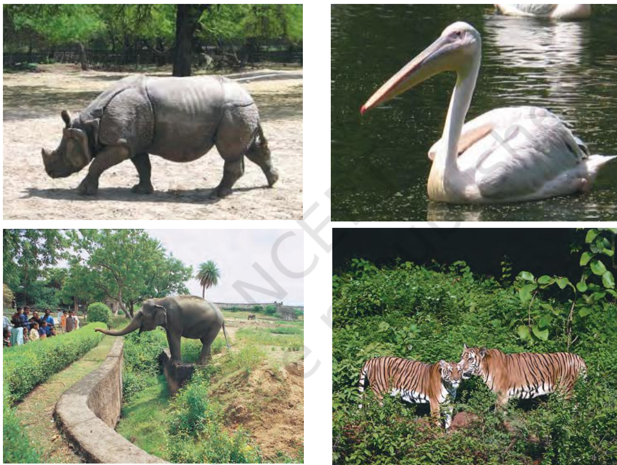
Figure 1.3 Pictures showing animals in different zoological parks of India

These are the places where wild animals are kept in protected environments under human care and which enable us to learn about their food habits and behaviour. All animals in a zoo are provided, as far as possible, the conditions similar to their natural habitats. Children love visiting these parks, commonly called Zoos (Figure 1.3).