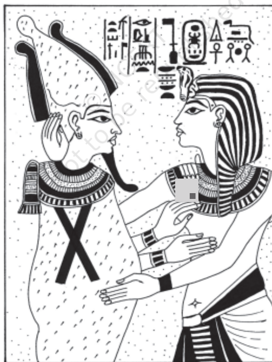
Mural in King Tut's tomb showing King Tut with Osiris, the god of the afterlife

Back in the trailer a technician pulled up astonishing images of Tut on a computer screen. A grey head took shape from a scattering of pixels, and the technician spun and tilted it in every direction. Neck vertebrae appeared as clearly as in an anatomy class. Other images revealed a hand, several views of the rib cage, and a transection of the skull. But for now the pressure was off. Sitting back in his chair, Zahi Hawass smiled, visibly relieved that nothing had gone seriously wrong. "I didn't sleep last night, not for a second," he said. "I was so worried. But now I think I will go and sleep."