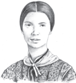
Emily Dickinson 1830-1886

Emily Dickinson is regarded as one of America's quintessential poets of the nineteenth century. She lived an introverted and hermetic life, and published very few of her poems in her lifetime. Her output, 1789 poems in all, were published posthumously. Her poetry is characterised by unconventional capitalisation and extensive use of dashes, along with unusual imagery and lyric style.