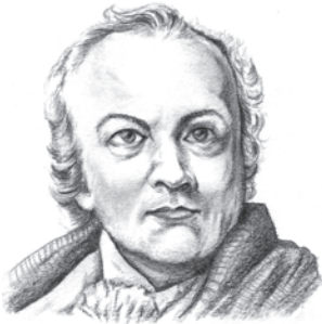
William Blake 1757-1827

William Blake was a poet, painter and engraver. He abhorred the rationalism and materialism of his times. What he saw and painted were human beings beset with evil, yet striving for the divine within them.