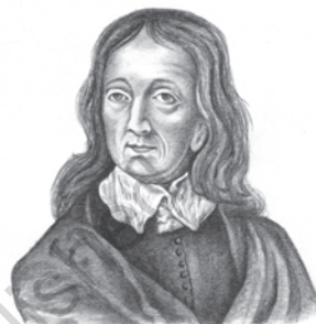
John Milton 1608-1674

John Milton began writing poetry at the age of ten. After finishing his formal education at Cambridge, he read almost everything available in Latin, Greek, Italian and English. He was appointed Latin Secretary where he worked so hard that eyestrain, from years of late night reading, caused him to become totally blind at the age of forty-five. In the final years of his life he wrote (through dictation) Paradise Lost and Paradise Regained.