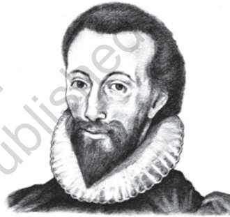
John Donne 1572-1631

The total effect of a metaphysical poem at its best is to startle the reader into seeing and knowing what he has not really noticed or thought about before. Like all Donne's poetry this poem too reflects an emphasis on the intellect and wit as against feeling and emotion.