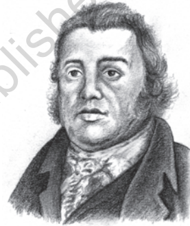
S.T. Coleridge 1772-1834

The genesis of this poem was a vision seen by Coleridge in a trance-like state of mind. He tried to capture its essence but an interruption caused an irreparable break in his poetic flow.