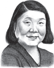
Bi Shu-min Born 1952

Bi Shu-min has been serving her country, China, as a doctor for over twenty years. She also has a Master's degree in literature from the Beijing Teacher's College.