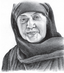
Kamala Das 1934-2009

One of the greatest literary figures in Malayalam, Kamala Das was born in the year 1934 in Punnayurkulam, in South Malabar, Kerala. Her work, in poetry and in prose, has given her a permanent place in modern Malayalam literature as well as in Indian writing in English. She is best known for her feminist writings and focus on womanhood.