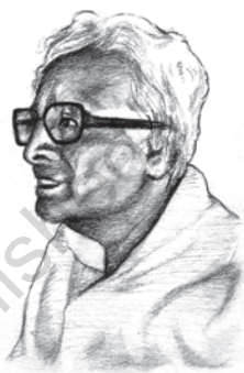
A.K. Ramanujan 1929-1993

His interests included anthropology and folklore. These influenced his work as a craftsman of English. This poem represents the complex distillation of a lifetime of unusual thought and feeling.