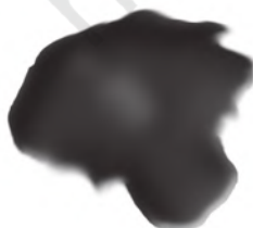
Fig. 5.3: Coal tar

It is a black, thick liquid (Fig. 5.3) with an unpleasant smell. It is a mixture of