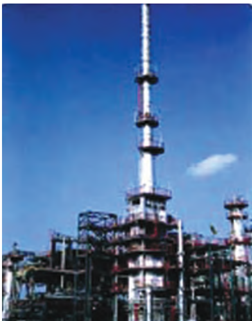
Fig. 5.5: A petroleum refinery

separating the various constituents/ fractions of petroleum is known as refining. It is carried out in a petroleum refinery (Fig. 5.5).