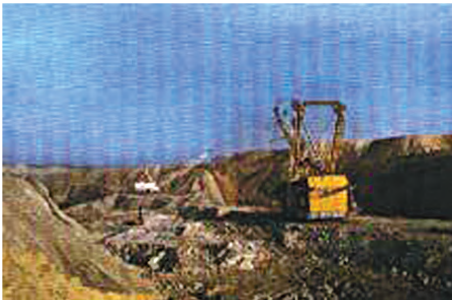
Fig. 5.2: A coal mine

When heated in air, coal burns and produces mainly carbon dioxide gas.