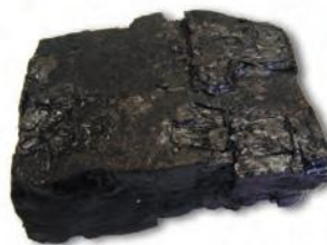
Fig. 5.1: Coal

You may have seen coal or heard about it (Fig. 5.1). It is as hard as stone and is black in colour.