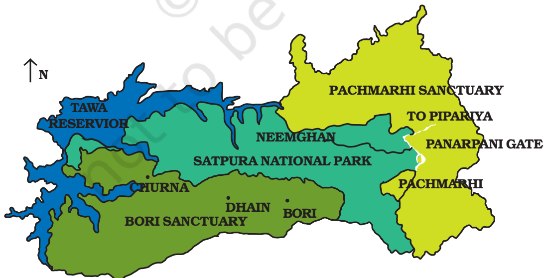
Fig. 7.1 : Pachmarhi Biosphere Reserve