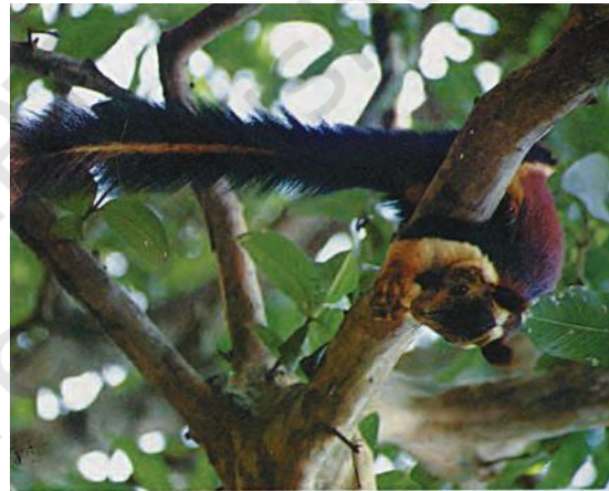
Fig. 7.3 (b) : Giant squirrel

endemic flora of the Pachmarhi Biosphere Reserve. Bison, Indian giant squirrel [Fig. 7.3 (b)] and flying squirrel are endemic fauna of this area. Professor Ahmad explains that the destruction of their habitat, increasing population and introduction of new species may affect the natural habitat of endemic species and endanger their existence.