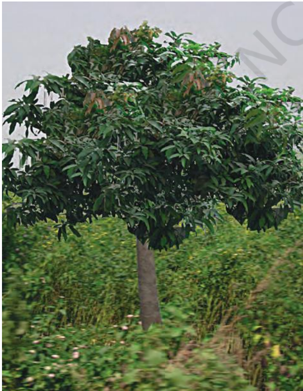
Fig. 7.3 (a) : Wild Mango

Madhavji shows sal and wild mango (Fig. 7.3 (a)) as two examples of the