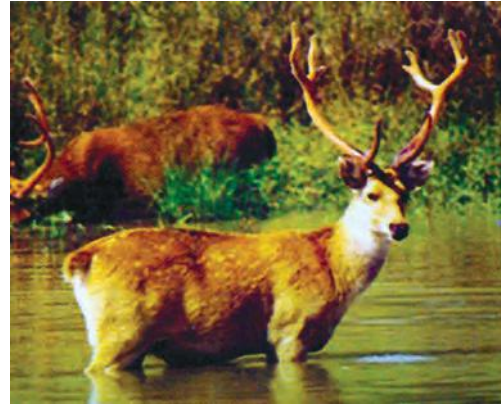
Fig. 7.6 : Barasingha

animals has become difficult because of disturbances in their natural habitat. Professor Ahmad tells them that in order to protect plants and animals strict rules are imposed in all National Parks. Human activities such as grazing, poaching, hunting, capturing of animals or collection of firewood, medicinal plants, etc. are not allowed