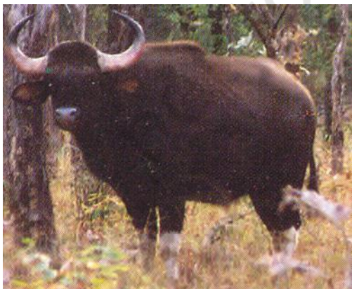
Fig. 7.5 : Wild buffalo

buffaloes (Fig. 7.5) and barasingha (Fig. 7.6) were also found in the Satpura National Park. Animals whose numbers are diminishing to a level that they might face extinction are known as the endangered animals . Boojho is reminded of the dinosaurs which became extinct a long time ago. Survival of some