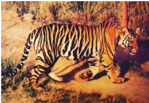
Fig. 7.4 : Tiger

Tiger (Fig. 7.4) is one of the many species which are slowly disappearing from our forests. But, the Satpura Tiger Reserve is unique in the sense that a significant increase in the population of tigers has been seen here. Once upon a time, animals like lions, elephants, wild