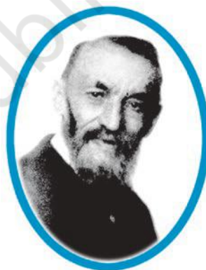
G. Peano (1858-1932)

In contrast to deduction, inductive reasoning depends on working with each case, and developing a conjecture by observing incidences till we have observed each and every case. It is frequently used in mathematics and is a key aspect of scientific reasoning, where collecting and analysing data is the norm. Thus, in simple language, we can say the word induction means the generalisation from particular cases or facts.