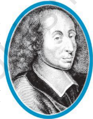
Blaise Pascal (1623-1662)

In earlier classes, we have learnt how to find the squares and cubes of binomials like a + b and a - b . Using them, we could evaluate the numerical values of numbers like (98)^2 = (100 - 2)^2 , (999)^3 = (1000 - 1)^3 , etc. However, for higher powers like (98)^5 , (101)^6 , etc., the calculations become difficult by using repeated multiplication. This difficulty was overcome by a theorem known as binomial theorem. It gives an easier way to expand (a + b)^n , where n is an integer or a rational number. In this Chapter, we study binomial theorem for positive integral indices only.